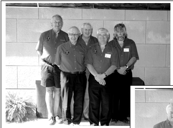
Wales Seniors' Team I: